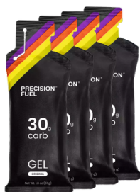
Precision Fuel PF30

Aid Station Locations: Marathon mile 7.8, 10.4, 12.2 (Precision Fuel station) , 14.7, 16.9, 19.0 (Precision Fuel Station) , 21.2, 23.0, 24.5.