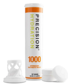
Precision Hydration PH 1000