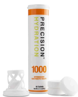
Precision Hydration PH 1000