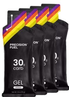
Precision Fuel PF30

Aid Station Locations: Mile 2.5, 4.8, 7.8, 10.4, 12.2 ( Precision Fuel station ), 14.7, 16.9, 19.0 ( Precision Fuel station ), 21.2, 23.0, 24.5.